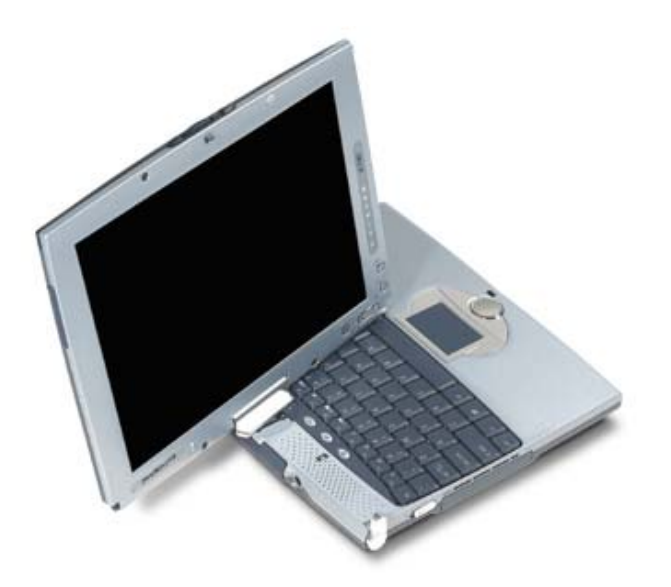
Figure A–1. Example pen tablet PC.

This pen tablet PC weighs only 3.1 pounds, has a 10.4-inch viewable screen, and comes standard with an 800 MHz CPU, 128 MB of RAM, and a 20 GB hard drive. In addition to the standard touch screen display, the latest generation of Tablet PCs includes a wireless keyboard to facilitate data entry. The Tablet PC shown in Figure 1 converts easily from a Tablet PC to a Notebook PC form factor. Our proposed instrument design using this technology is described in the following paragraphs. The instrument will be developed (i.e., programmed) to collect the fact-to-face interview data in three stages, following the steps of the combined BSIT / CIM interview process.